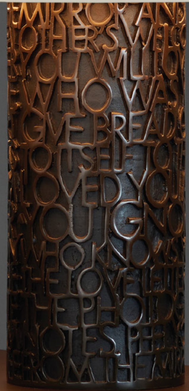
Castries Table lamp

The Prism lights up in the sun creating an enigmatic play on its surface of mother-of-pearl and muted tones of straw marquetry.