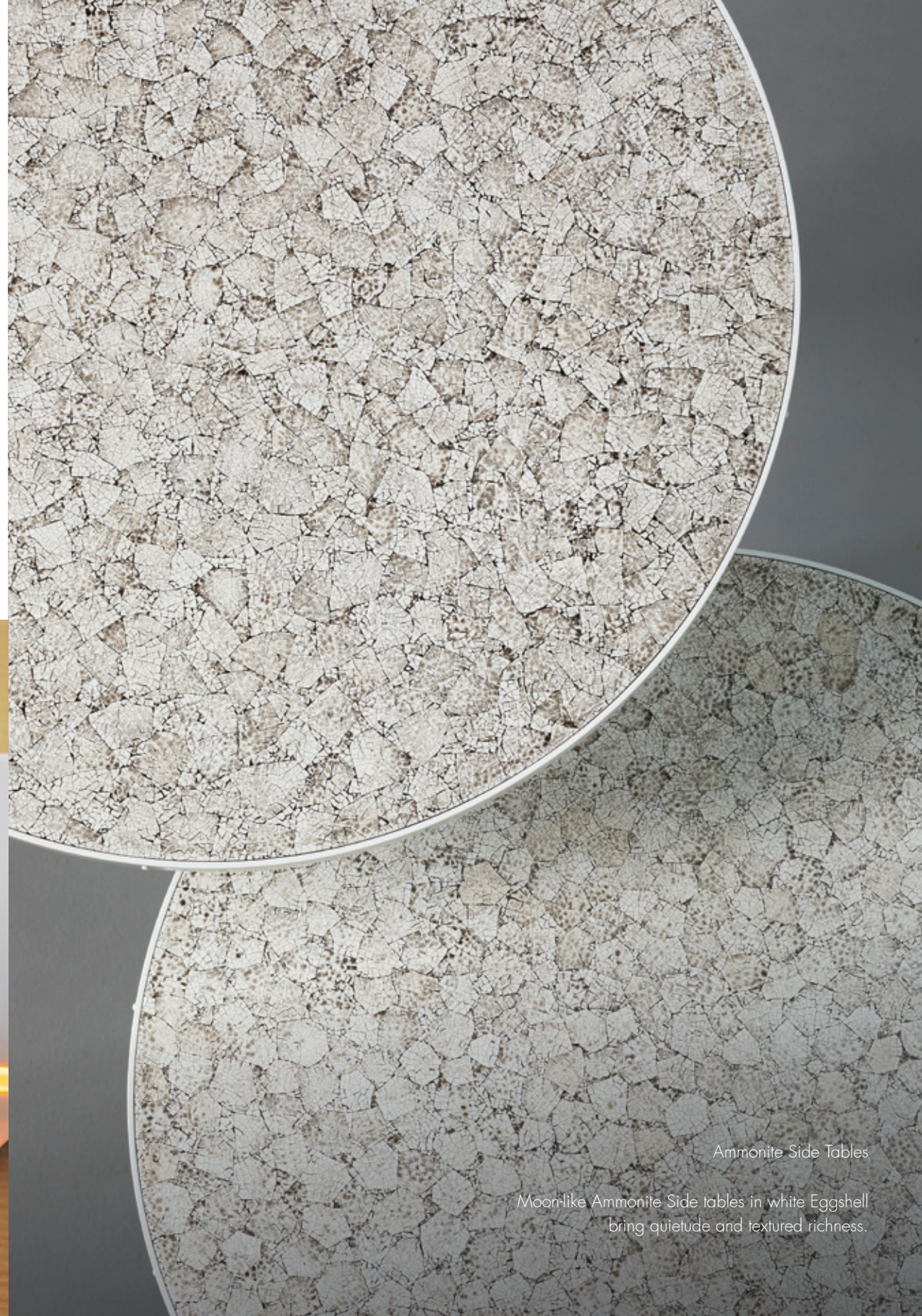
Ammonite Side Tables

A delightful wall sconce designed by Antonio da Motta now available in white lacquer with pure gold leaf lining.