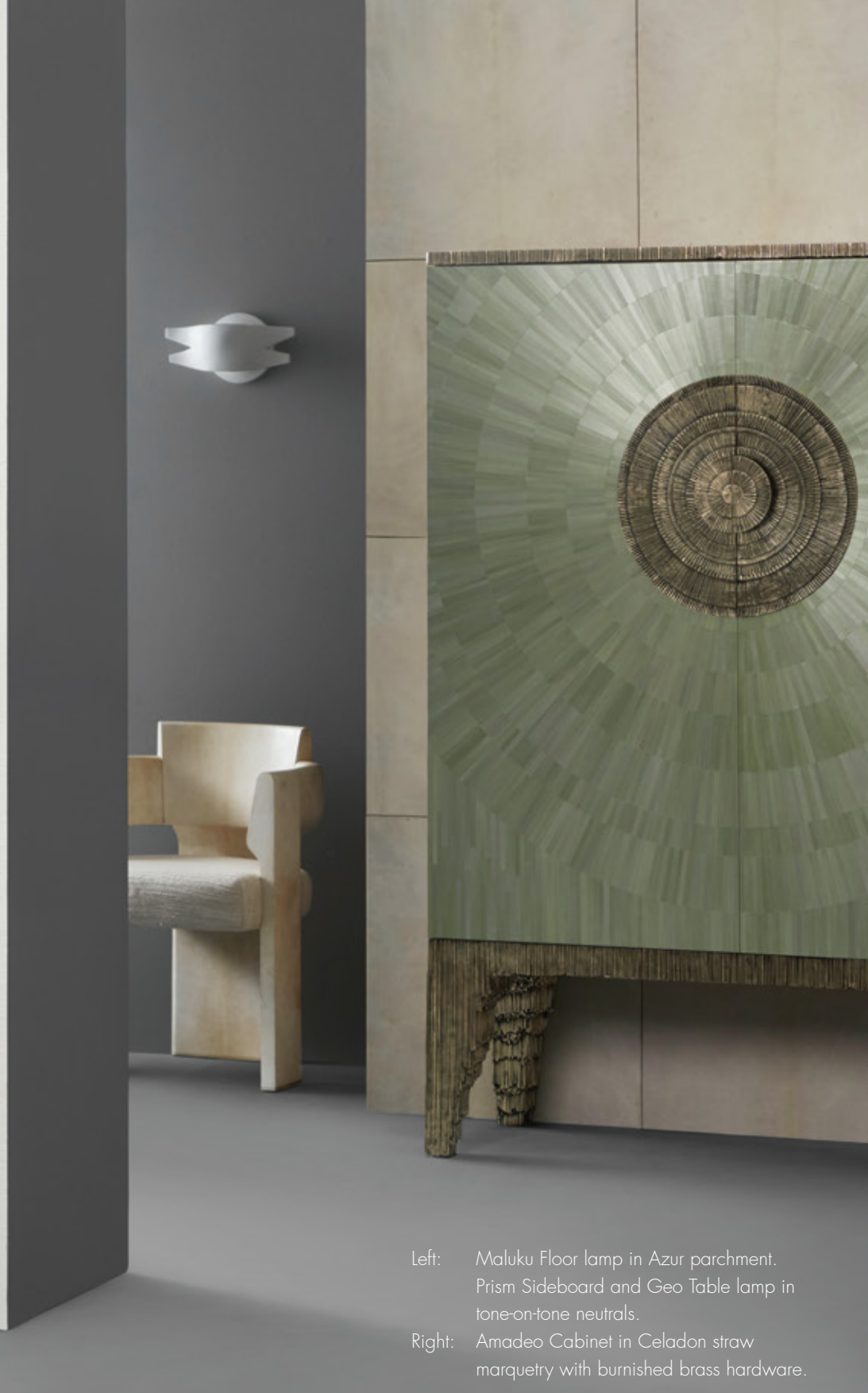
Left: Maluku Floor lamp in Azur parchment. Prism Sideboard and Geo Table lamp in tone-on-tone neutrals. Right: Amadeo Cabinet in Celadon straw marquetry with burnished brass hardware.