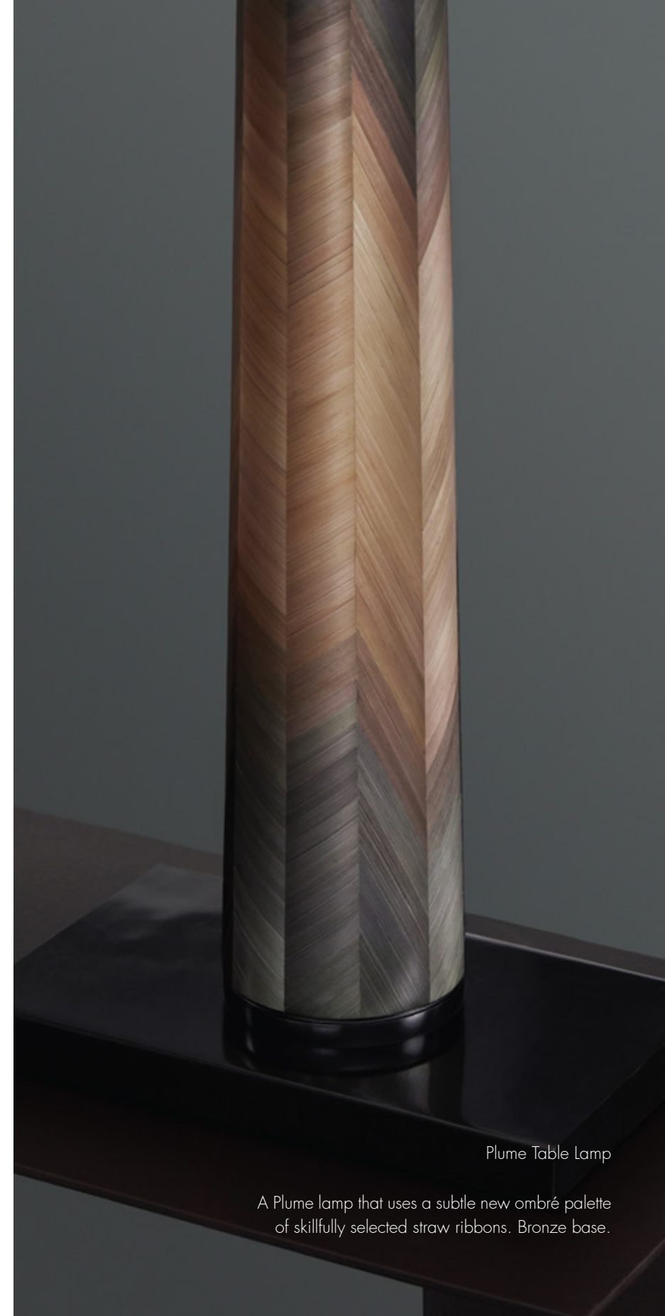
Plume Table Lamp

A Plume lamp that uses a subtle new ombré palette of skillfully selected straw ribbons. Bronze base.